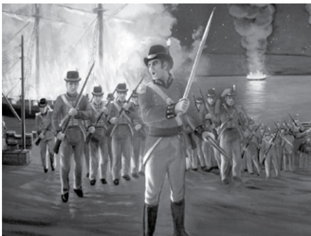
Segment of 23-ft mural installed on the first floor of the Connecticut River Museum. Mural created by noted painter and muralist, Russell Buckingham. In foreground, British Commanding Officer Coote, brandishing his sword.

For more information and continual updates of commemoration activities visit BattleSiteEssex.org .