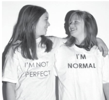
At the Girls Unlimited! conference, participants will examine and question the media images they see every day.

Here's a sample of what conference participants can explore on May 31st: · Blurred Lines: watching music videos depicting double standards and stereotypes about men and