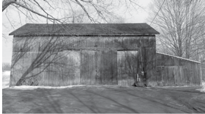
Big Barn

Did you ever wonder how it was on the Farm years ago? Well, that big barn is going to be restored, and after the three year project is completed the residents of Guilford will have one of the area's best exhibits of farm equipment and tools.