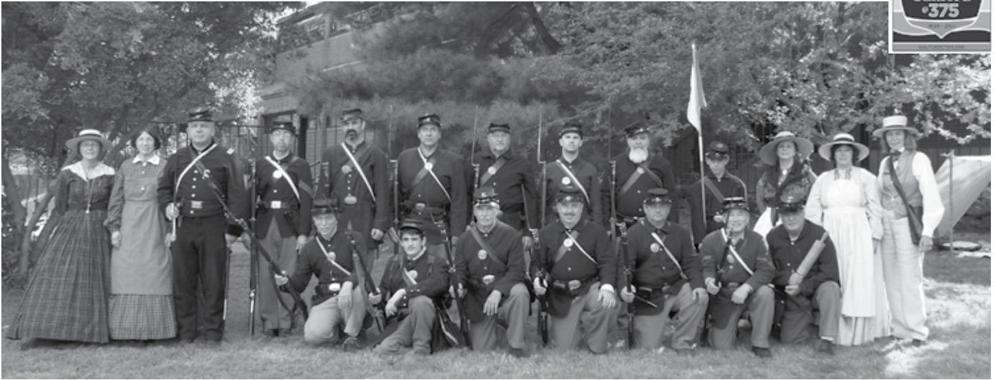
Civil War

History comes alive when Guilford and the Civil War: A Day of Tribute takes place on the Guilford Green on Saturday, May 31st, from 11 am to 7 pm. The Guilford 375th Anniversary Signature Event commemorates the Civil War, in which more Guilford townspeople fought than in any other war.